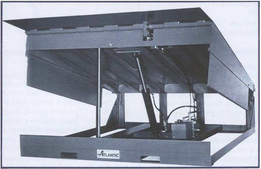
Military tested to exceed manufacturer's promotions for safety & performance.